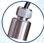
Waterproof Cable Outlet